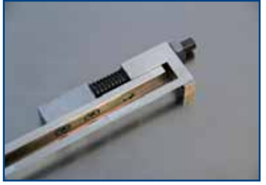
Stainless steel ribbon